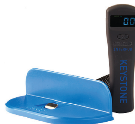
pictured above: keystone device